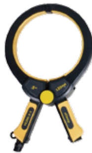
50mm, 100mm, 125mm sizes Transmitter clamps